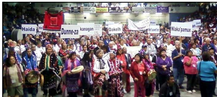
The view from the stage at the Entry of Nations.