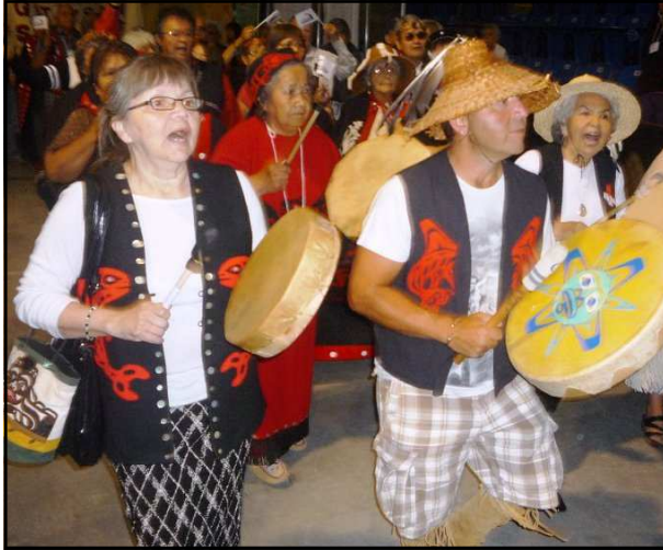
The elders raised the roof with their drumming and singing at the Entry of Nations of the BC Elders Gathering in Salmon Arm in July, 2010.