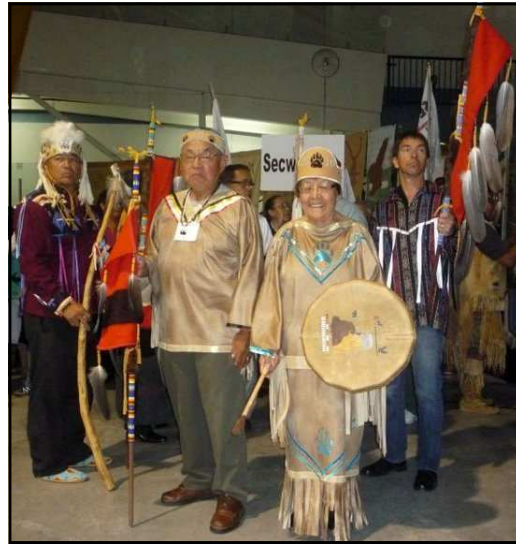
Secwepemc ready to lead the Entry of Nations.