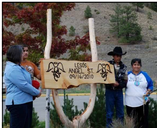
Skeetchest'n hosted a ceremony to name Angel Street .