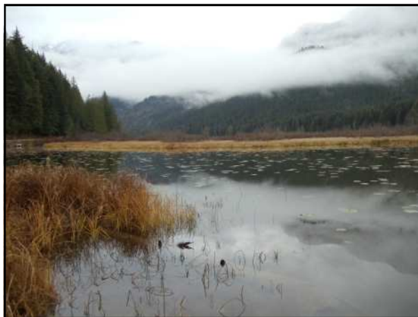
Wap Creek valley.